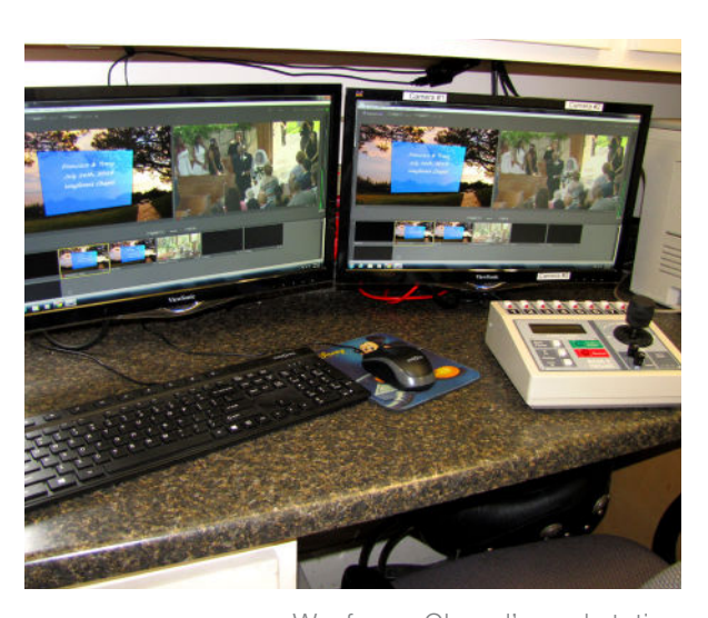
Wayfarers Chapel's workstation

"We stream our wedding ceremonies and Sunday services to Sunday Streams," says Steve. "Sunday Streams has been extremely accommodating and helpful in developing a solution for our needs and the volume we anticipate. Couples who choose the streaming option can enjoy their wedding as Video On Demand for two weeks after the wedding. We record an HDV signal on DV tape on the camera for backup and archival, Apple Pro Res files are recorded on the Atomos Ninja 2's for possible post production editing for Blu-Ray encoding and burning. Simultaneously, Wirecast allows us to record an .mp4 file of the live mixed ceremony/program locally. At the conclusion of the ceremony we drag and drop to a DVD Data Disc or thumb drive and present to the couple as they leave the grounds, approximately 40 minutes after the ceremony is over. The DVD is preprinted with the couples' names and date, and the optional thumb drives are imprinted with a Wayfarers logo."